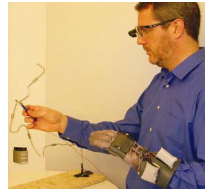
figure 2: A person using the HotWire setup

A person using the apparatus is shown in figure 2. The matching tasks are presented in an SV-6 monocular HMD from MicroOptical with 640x480 pixels resolution and 18 bits color depth. Being non-transparent and relatively small, the HMD can be positioned so that it does not obscure the user's regular field of view, while remaining easily accessible via glances of the eye.