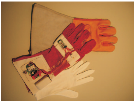
Fig. 1. Layer-based Wearing Concept of the Data-Glove

The wearing concept is based on three different gloves that build the actual data glove. By changing the outer glove the device can be adapted to specific application domains whereas the inner glove can be used for hygiene aspects. Figure 1 shows the data glove used in our experiments as well as its layer-based wearing concept.